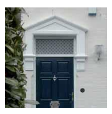
1441 – Elmley Cottage was recorded as a new building on the land where Elmley House now stands. Records show that a cottage has stood here from that time. In 1675 it became the property of the owner of the Pound